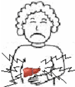
RUQ abdominal tenderness