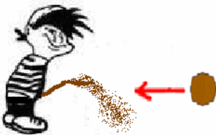
Tea/coffee colored urine