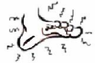
Numbness/tingling in hands/feet