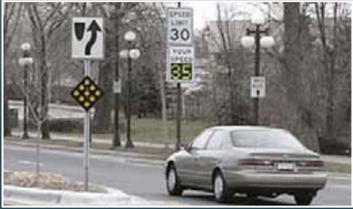
Driver Feedback Sign