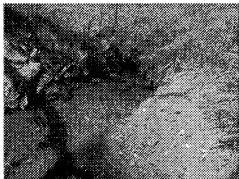
• Culvert flowing into Dead Lake under CSAH 35