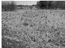
Western most portion of Ditch: Channel where water used to flow before being cut off from Star Lake