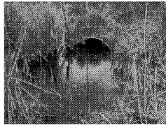
Culvert on West Side of CSAH 35