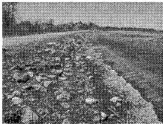
Star Lake Shoreline: Ditch 23 should outlet in this area